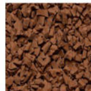
Beige Brown #076 [Mocha #8024]