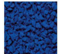
Dark Blue #054 [Navy Sea #5010]