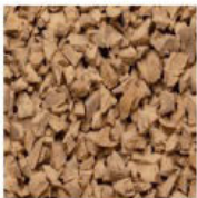
Beige #066 [Wheat # 1014]