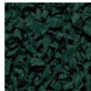
Dark Green #47 [Forest #6005]