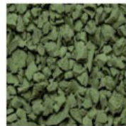
Green #067 [Sage #6021]