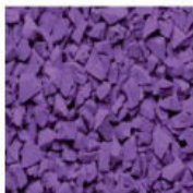
Lilac #044 [Lavender #4005]