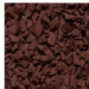
Brown #046 [Chocolate #8025]