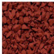
Red #062 [Rust #3016]