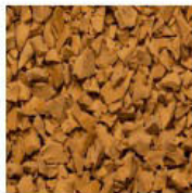
Yellow #069 [Desert Sand #1002]