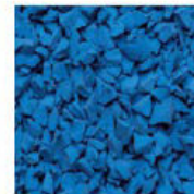
Blue #064 [Ocean #5015]