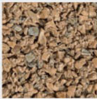
Fawn * #833