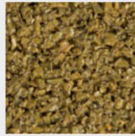
Sand * #816